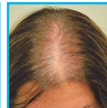
FEMALE PATTERN HAIR LOSS